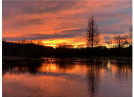
Sunset on the River Teith at Callander meadows, 20 January 2021